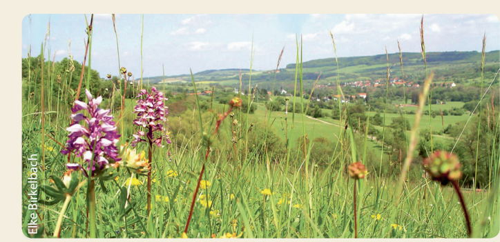
Gersheim Orchid Area