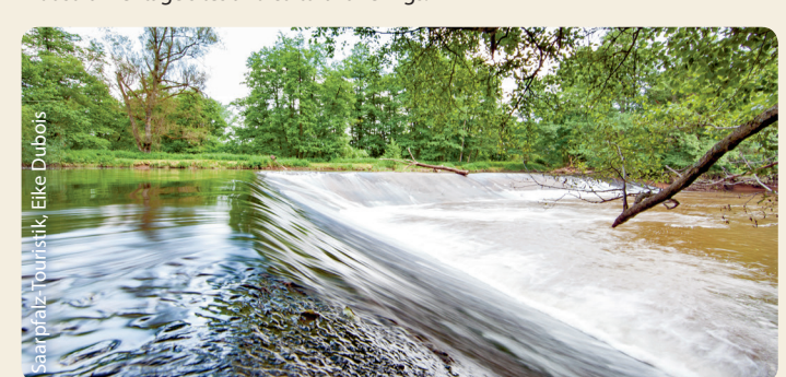
Weir on the Blies

...is located in the immediate vicinity of the Palatinate Forest and the Northern Vosges Mountains. Even though it is only one eighth the size of the Saarland region, this tranquil gem of a location surprises visitors with its diversity. The southern Bliesgau is on a fossil seabed, which has been farmed extensively for centuries. Be it extensive orchards, colourfully dappled flower meadows or splendidly blooming orchids, the south is a refuge for particularly rare species and boasts a captivating, gently rolling landscape. The northern part is completely different, where extensive beech forests on high ridges alternate with valleys and rock formations in the red sandstone. And right in the middle of it all, the River Blies, which is accompanied by a wildly romantic floodplain landscape for long stretches of its path through the region. The scenic charm of the region is complemented by the town of St. Ingbert with its industrial heritage sites and cultural offerings.