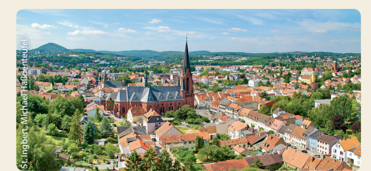
Biosphere Town St. Ingbert